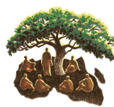
Alan J. Flisher Centre for Public Mental Health